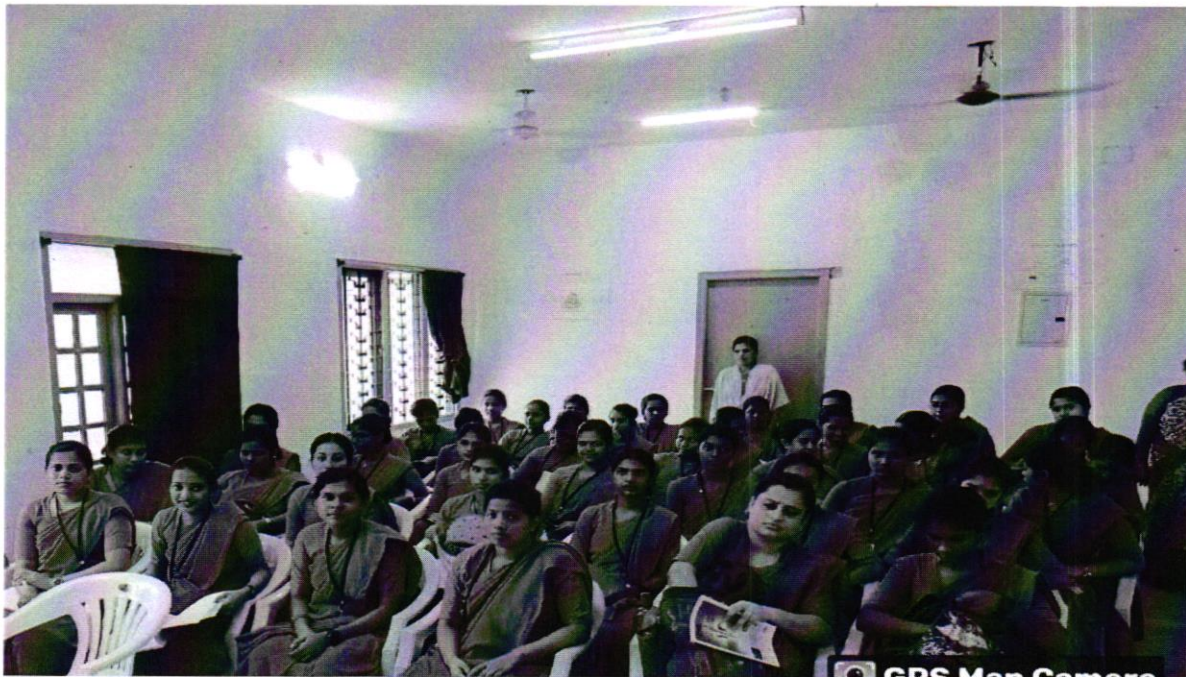
Students were attending orientation about PHC with medical officer on 11.03.2024.