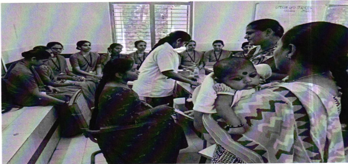
Fig: Students were observing the medications needed for well baby clinic on 01.05.2024