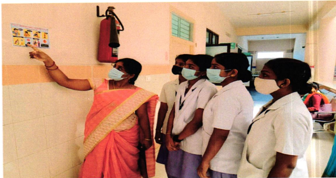
Students visited Damien Leprosy and Tb Hospital faculty explaining about the posters related to Respiratory hygiene practices on 16.04.2024