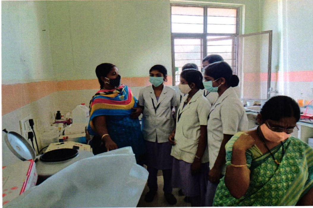
Students visited laboratory at Damien Leprosy And Tb Hospital and have interaction with lab- technician about various diagnostic tests on 16.04.2024.