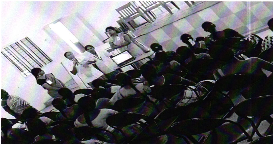
Students are providing health education on the importance of Immunization on 14.04.2025

The observational visit provided students with valuable insights into the functions and activities of a PHC. The experience will help them appreciate the importance of primary healthcare in promoting good health and well-being